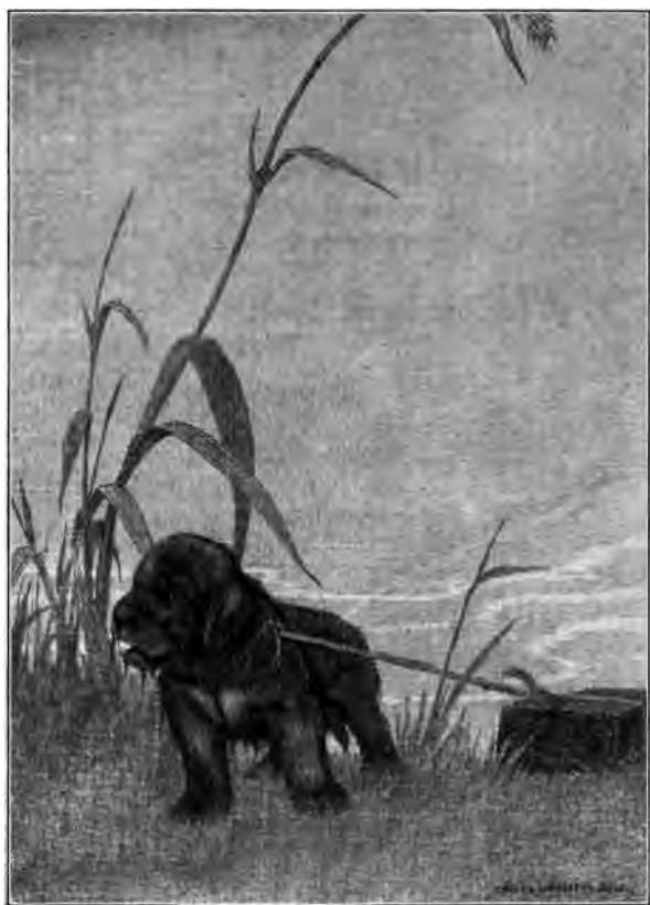
THE LEADING OBJECT PROVED TO BE A SMALL, WET, SHIVERING, WHIMPERING PUPPY